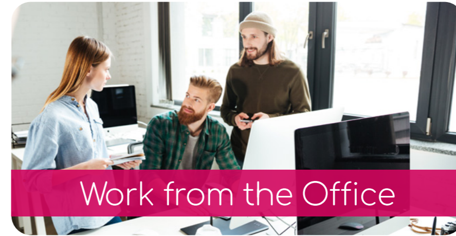
Work from the Office