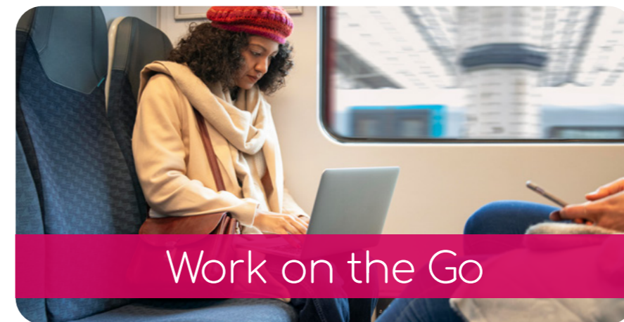
Work on the Go