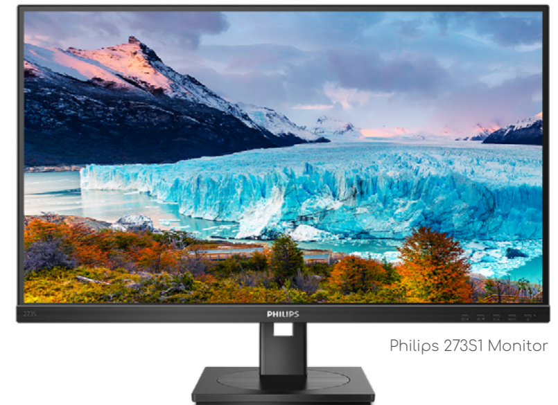
Philips 273S1 Monitor

It promotes flexibility, cost-effectiveness, customisation and adaptability to enhance employee satisfaction, increase productivity and simplify remote collaboration.